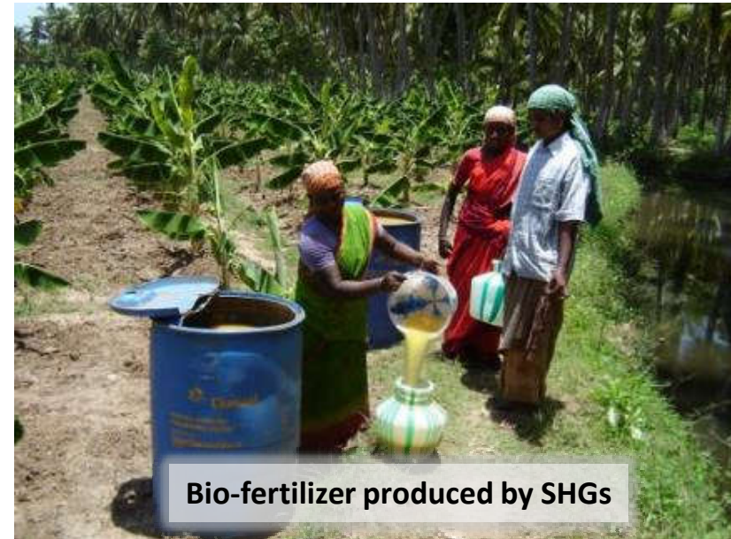
Bio-fertilizer produced by SHGs